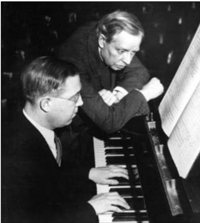
Leo Sowerby (playing the piano) and Frederick Stock reviewing the score of Passacaglia, Interlude and Fugue , February 1934.