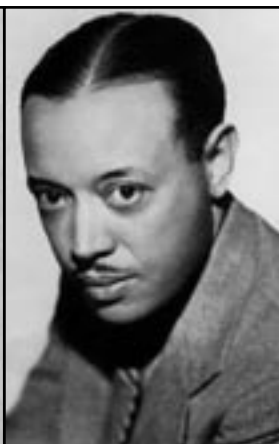
WILLIAM GRANT STILL